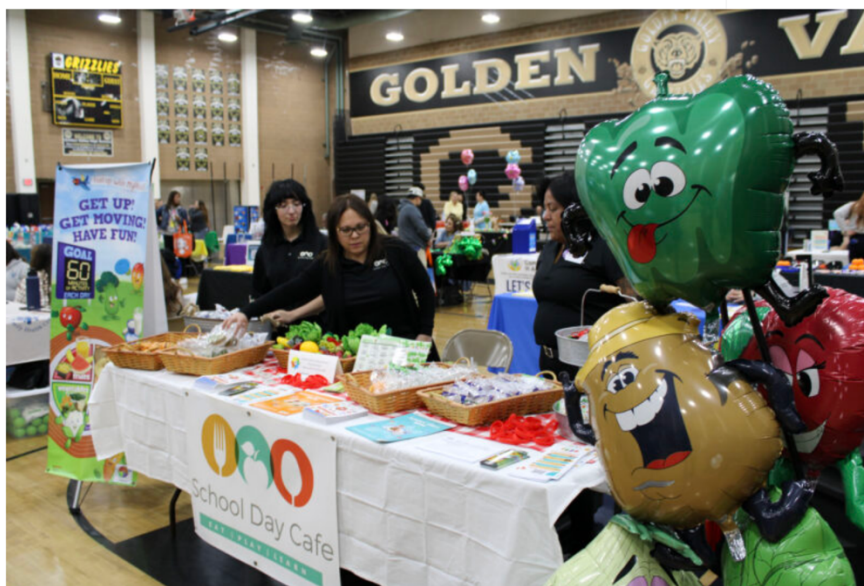
School Day Cafe workers at their booth educate families about nutrition and food in schools on March 15, 2025 at the Many Families, One Community family resource fair at Golden Valley High School.

KAMRYN MARTELL( HTTPS://SIGNALSCV.COM/AUTHOR/KMARTELL/ ) MARCH 20, 2025 1:54 PM